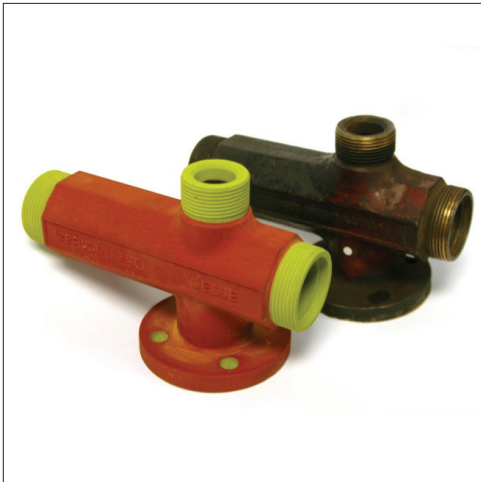
Top: The Digital Factory team used 3D scanning and 3D printing to replace damaged 19th century artifacts at County Durham's Beamish Museum.