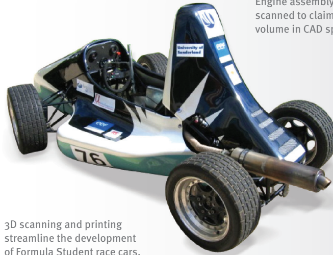
3D scanning and printing streamline the development of Formula Student race cars.